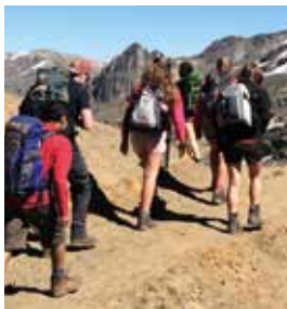
TRAVELLING FAR AND WIDE Pupils extend their learning overseas Pages 4-5