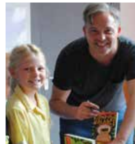
THE WRITE STUFF Three authors visit Junior School children Page 10

Read all about the Sixth Form Peru and Bolivia expedition on Page 4