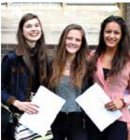
EXAM SUCCESSES GCSE and A Level students celebrate Page 2