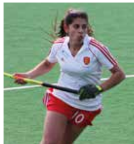
ENGLAND HOCKEY STAR Lily plays international matches Page 6