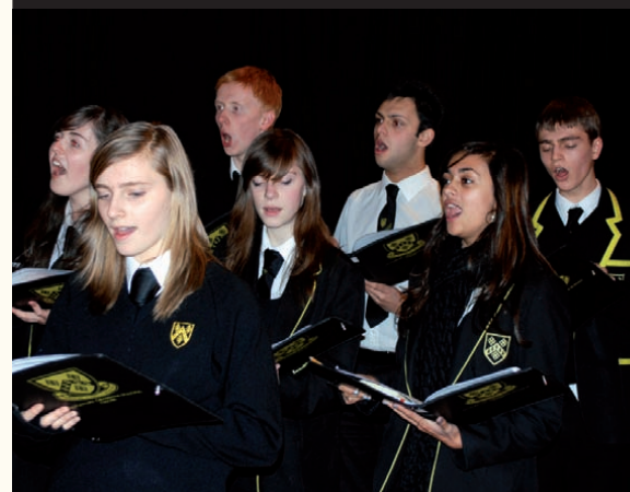
Chamber Choir in rehearsal

Events for the rest of the year include a 525th Anniversary Reception at Goldsmiths' Hall in London in May, and an open house History Day in September. This special year will also be marked with a fundraising initiative in support of the continuing bursary campaign to help bright children from all backgrounds fulfil their potential.