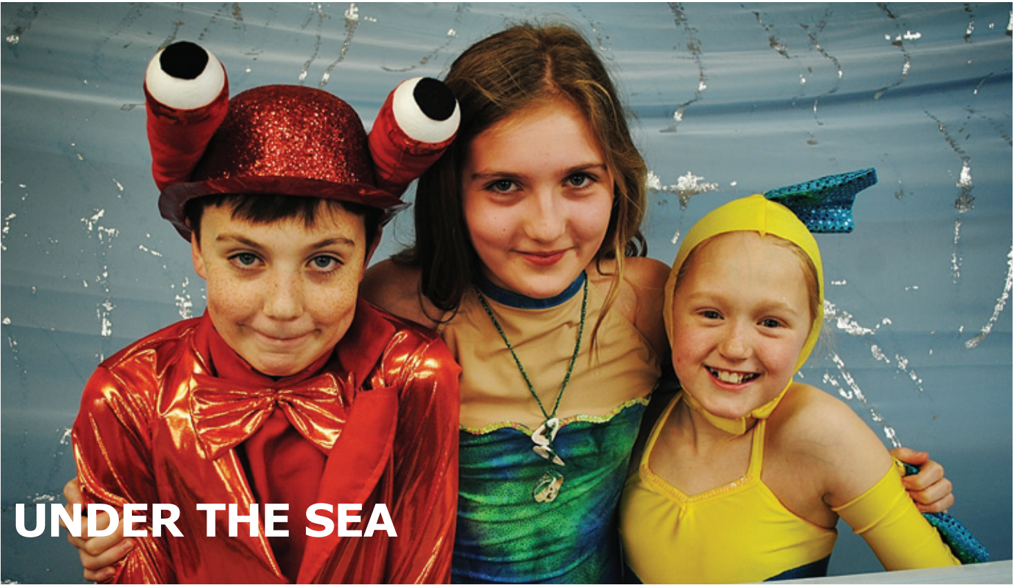
UNDER THE SEA

The Junior School’s ambitious Year 6 musical production, Disney’s The Little Mermaid , was a huge success, playing to sell-out audiences on the Senior School’s main stage over two nights. Featuring a large cast, colourful costumes and well-known songs, the show is an adaptation of Disney’s Broadway production.