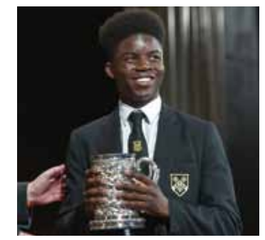
PRIZEWINNERS Speech Day celebrates the year's achievements Page 8