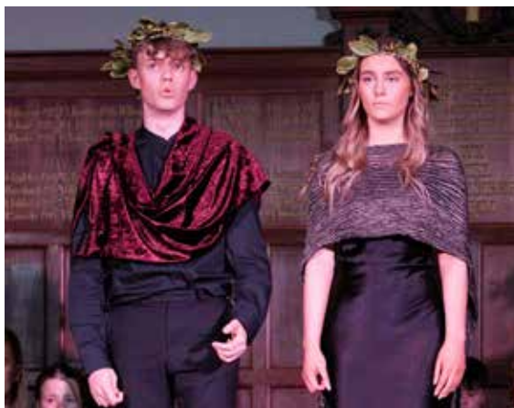
Performers in Dido and Aeneas

We will be following the OCR syllabus. No coursework is set in this subject.