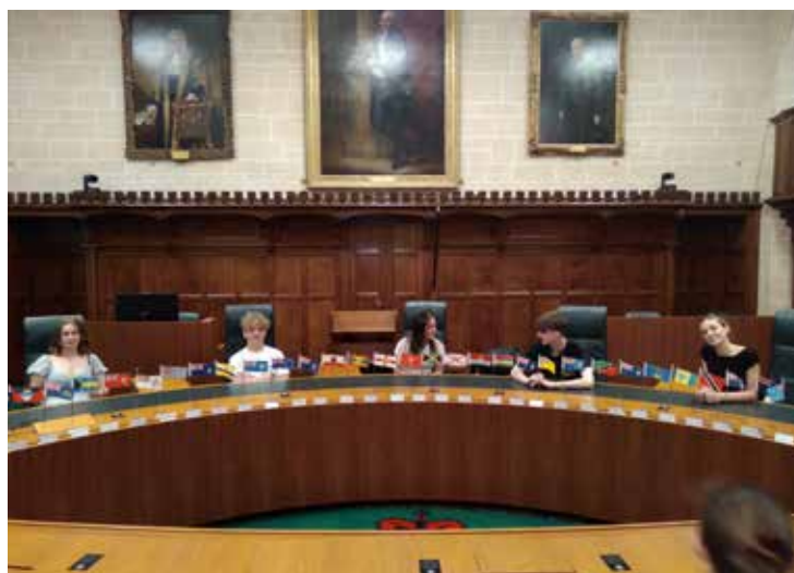
Sixth Form students on the Politics trip to London