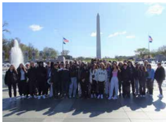
SGS Historians visited America in 2023

The History department is housed in the Woodmoor Building and each classroom has access to all multi-media equipment. The department organises attendance at conferences throughout the two year course, where students have the opportunity to listen to academics from prestigious universities talk about our subject. There is also an annual trip to the Houses of Parliament in London. Sixth formers have also participated in our trips to America, Russia and Germany, as well as the annual Battlefields trip.