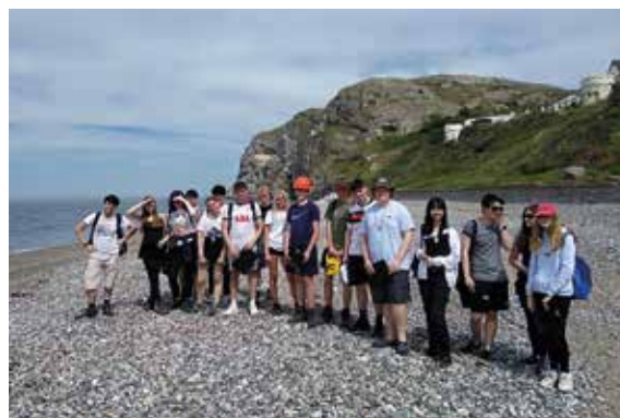
Field trip to Yorkshire

Sixth Form Geographers are encouraged to join the Manchester Geographical Association and frequent trips are organised to attend lectures at the University of Manchester.