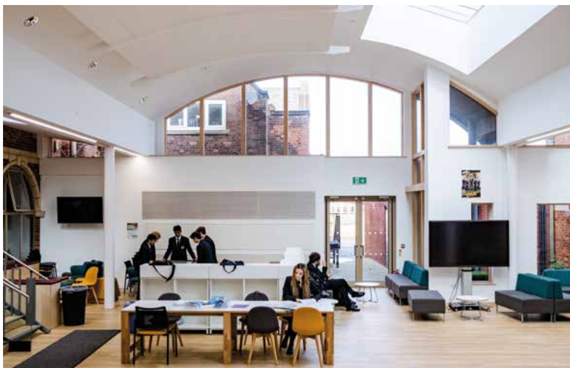
Sixth Form Facilities, opened in Autumn 2021

Upper Sixth Former now studying Business at Manchester University