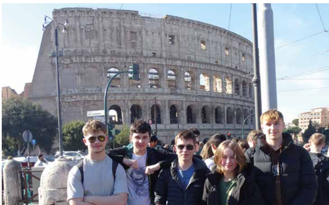
Trip to Rome, 2023

We will be following the OCR syllabus. No coursework is set in this subject.