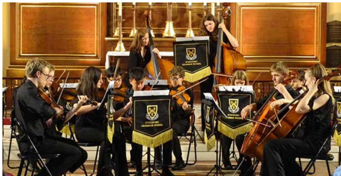
Pupils performing at St Paul's Church during the 2022 London Music Tour

In 2023, SGS received the highest possible rating from the Arts Council England, with a Platinum Artsmark Award.